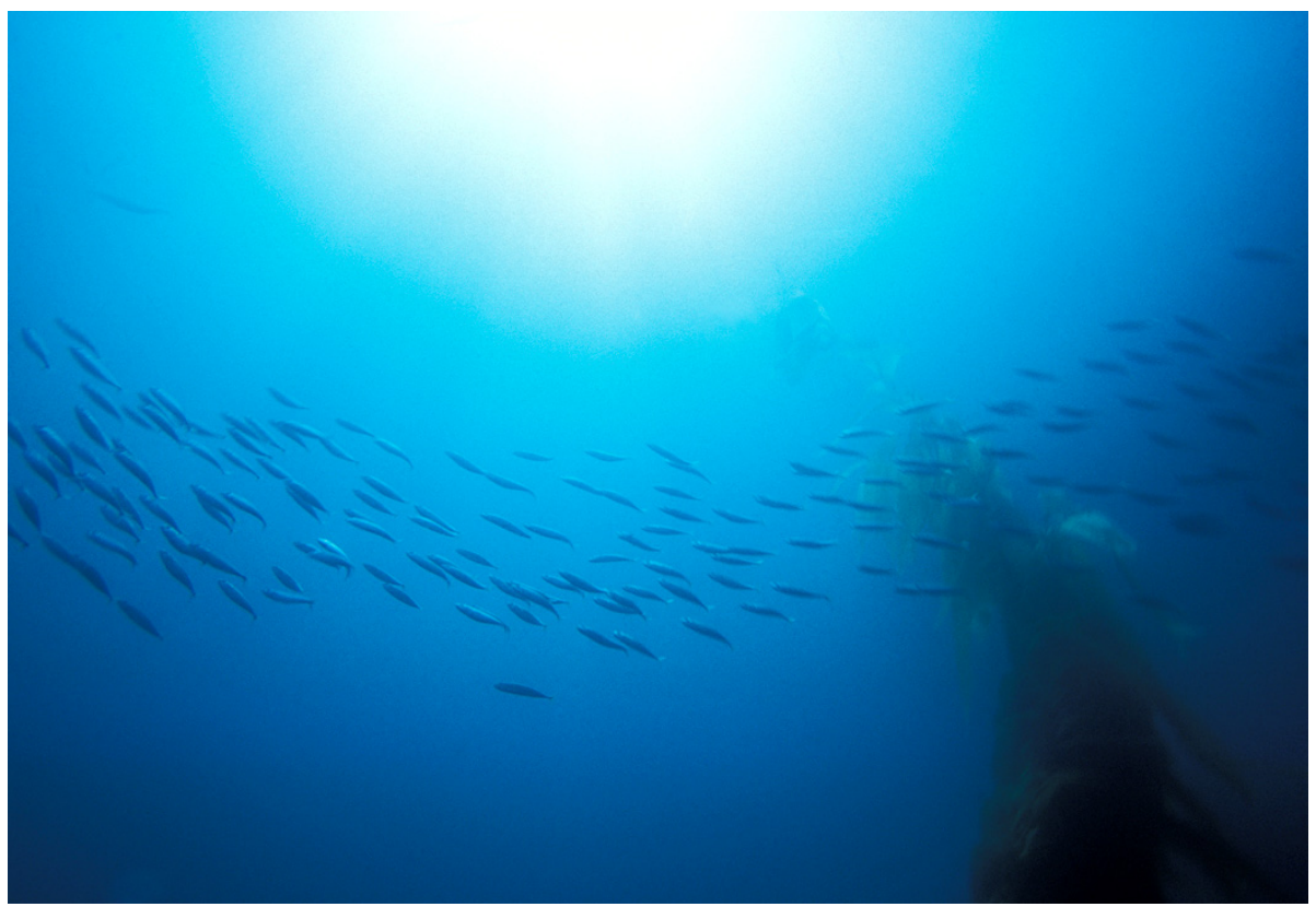
Wild Pacific sardines (Sardinops sagax) off Santa Cruz Island.

An emerging challenge for the Channel Islands National Marine Sanctuary