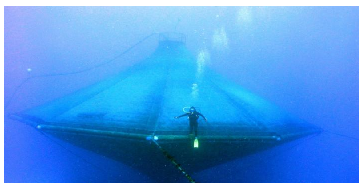
Figure 2.2.2: Submerged, "semi-rigid" fin fish enclosure at a pilot OOA facility offshore Puerto Rico.

Platform Grace is located in federal waters about 330 feet deep and approximately 3 NM from the CINMS boundary<sup>47</sup> (see figure 2.2.1 , above). The Grace Mariculture plan includes use of about 2.4 square kilometers (about 593 acres) of surface area around the facility, including two submerged "semi-rigid" cages, two "gravity cages" (pens suspended from circular floats) (see figures 2.2.2 and 2.2.3 , below), and approximately 19 "culture pools" on the main platform deck for hatchery and nursery operations.<sup>48</sup> The project would involve farming shellfish and fin fish, specifically mussels, abalone, striped bass (non-native), white sea bass, rockfish, California halibut, California yellowtail, and bluefin tuna.<sup>49</sup> A consultant report expected that the project would "produce approximately 100-300 metric tons (MT) of marketable seafood product annually … and … test critical components of a commercial scale operation." The pilot scale phase of the project was expected to last three years and, if proven feasible, the applicant planned