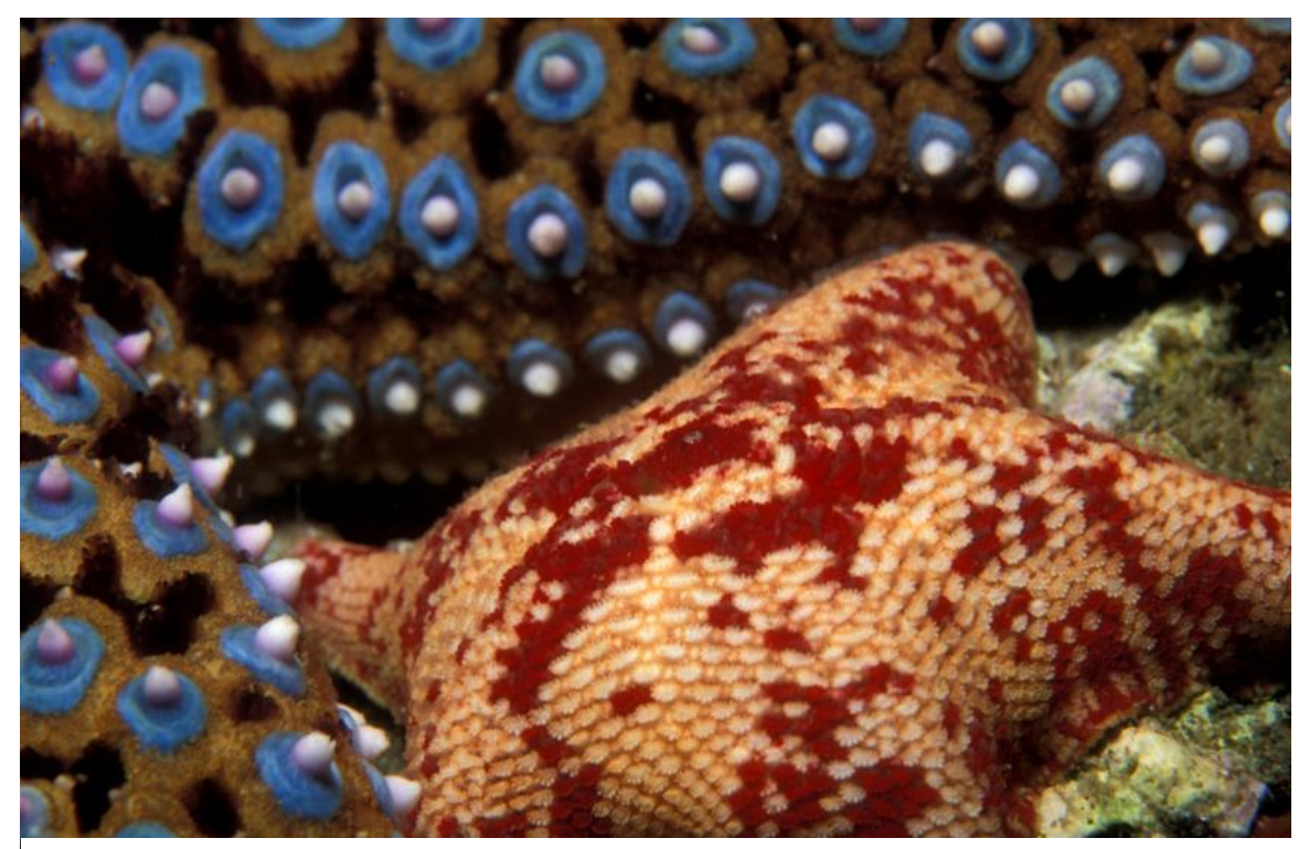
Figure 3.3 Benthic community members at Santa Cruz Island: bat star and giant spined sea star.

As mentioned in the opening sections, the deep waters and steady currents of open-ocean (EEZ) settings are attractive to aquaculture proponents such as the Bush administration in part because of the increased dilution power of this environment for the diverse and potentially toxic discharges and concentrated waste streams originating at commercial fish farms. Data demonstrate that these pollutants can cause harsh local environmental impacts; unfortunately, while open ocean settings may reduce the acuity of a given fish farm's pollution stream, other factors suggest that OOA discharges could cause similar problems in their environmental setting to those of fish farms situated in coastal settings.