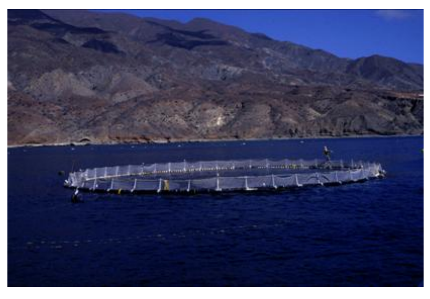
Figure 2.2.3: "Gravity cage" type fin fish enclosure.

The fate of the Grace Mariculture project resembles that of SeaFish Mariculture, which, at 34 miles offshore Texas, was the first aquaculture facility associated with а commercial offshore oil industry. After securing 1998 permits, in SeaFish actually commenced production of red drum, but ended only a year later in 1999 Shell because Oil decided to reactivate the platform for development of a nearby gas well.54